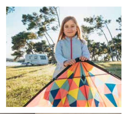
Altea is a joy to use, thanks to its inspired contemporary design and its light, spacious feeling. It's a highly practicable and robust caravan, available in many layouts.